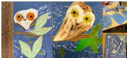
Year 1 Van Gogh barn owls