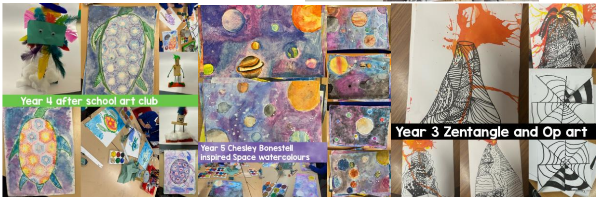
Year 4 after school art club