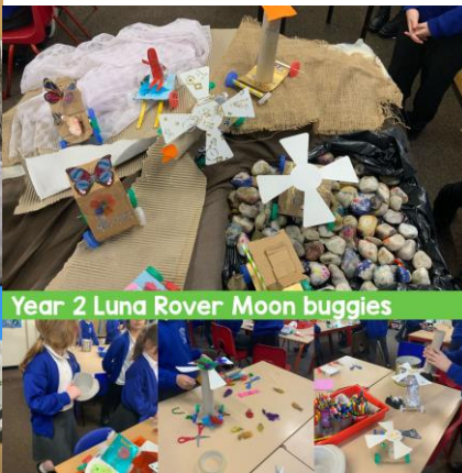
Year 2 Luna Rover Moon buggies